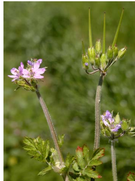
White-stem Filaree Erodium moschatum Introduced Annual Geranium Family