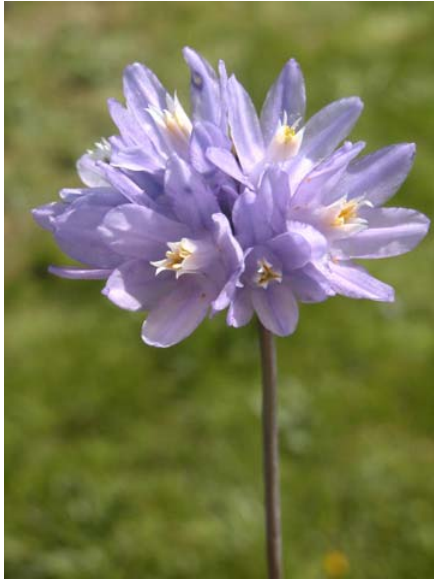
Blue Dicks Dichelostemma capitatum ssp. capitatum Native Perennial Lily Family