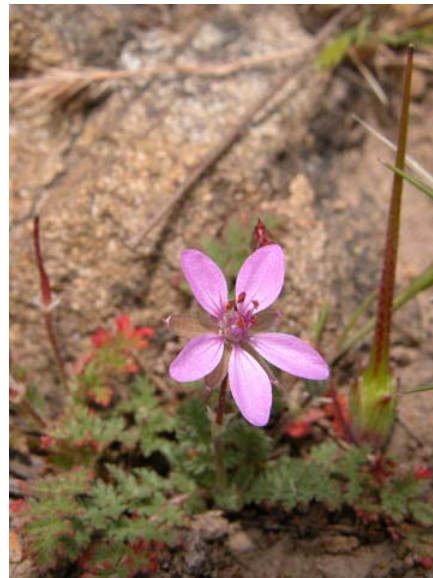
Red-stem Filaree Erodium cicutarium Introduced Annual Geranium Family