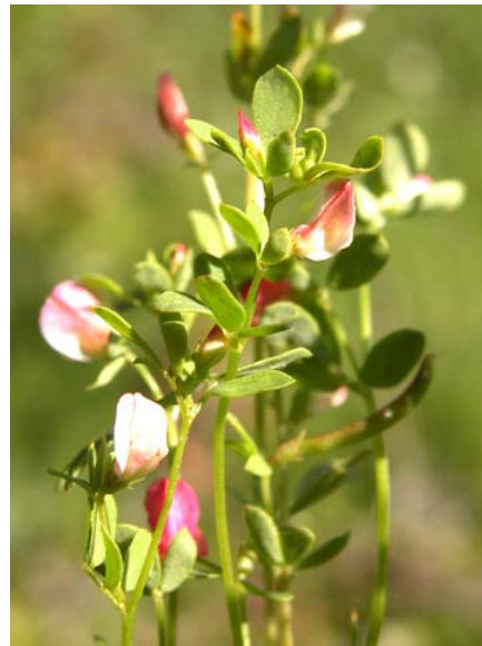
Spanish Clover Lotus purshianus var. purshianus Native Annual Pea Family