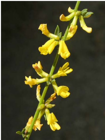
Deerweed Lotus scoparius var. scoparius Native Perennial Pea Family