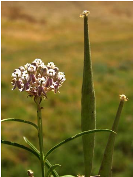
Whorled/Narrow-leaf Milkweed Asclepias fascicularis Native Perennial Milkweed Family