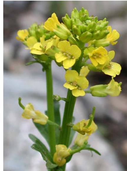
Erect-pod Winter Cress Barbarea orthoceras Native Perennial Mustard Family