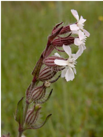
Windmill Pink Silene gallica Introduced Annual Pink Family