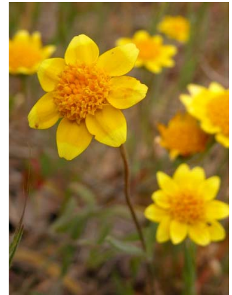
Goldfields Lasthenia californica Native Annual Sunflower Family