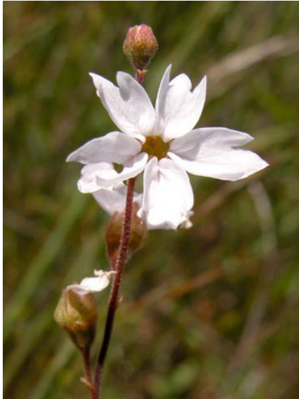
Woodland Star Lithophragma affine Native Perennial Saxifrage Family