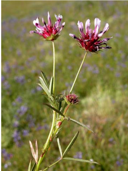
Tomcat Clover Trifolium willdenovii Native Annual Pea Family