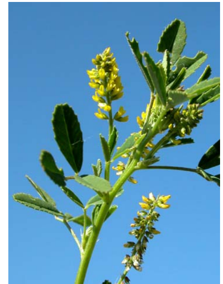
Sour Clover Melilotus indica Introduced Annual-Biennial Pea Family