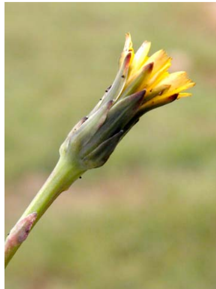
Smooth Cat's-ear Hypochaeris glabra Introduced Annual Sunflower Family