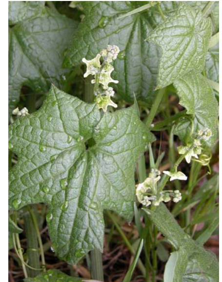
Common / California Manroot Marah fabacea Native Perennial Gourd Family