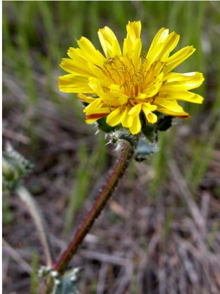
Bristly Ox-tongue Picris echioides Introduced Annual-Biennial Sunflower Family