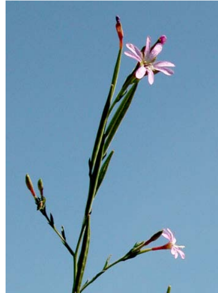
Panicled / Weedy Willowherb Epilobium brachycarpum Native Annual Evening Primrose Family