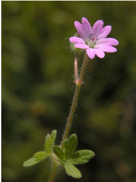
Hairy Dove's Foot Geranium Geranium molle Introduced Annual Geranium Family