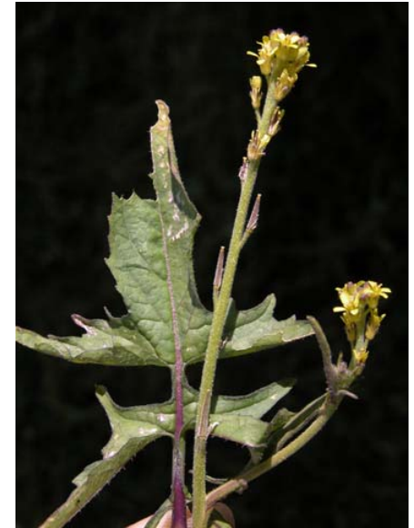
Black Mustard Brassica nigra Introduced Annual Mustard Family