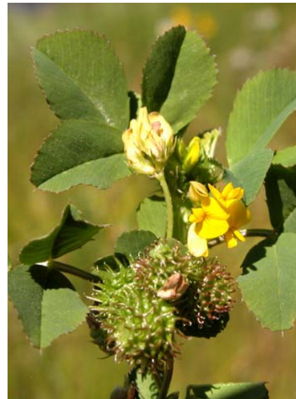
California Bur Clover Medicago polymorpha Introduced Annual Pea Family