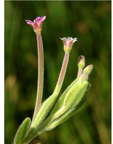
Common Willowherb Epilobium ciliatum ssp. ciliatum Native Perennial Evening Primrose Family