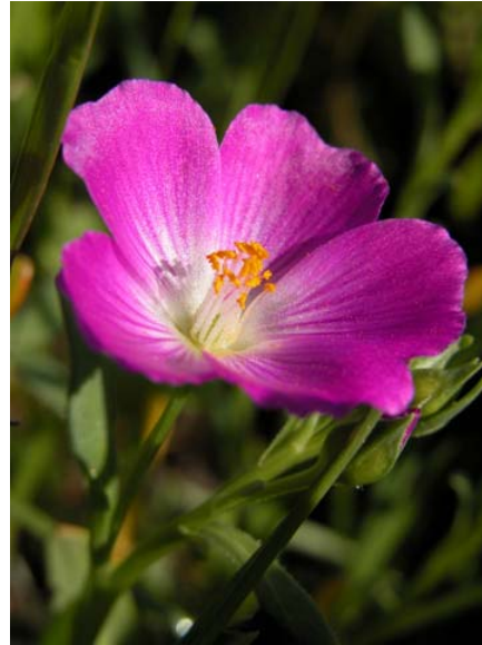
Magenta Red Maids Calandrinia ciliata Native Annual Purslane Family