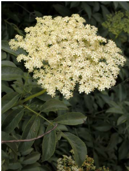
Blue Elderberry Sambucus mexicana Native Perennial Honeysuckle Family