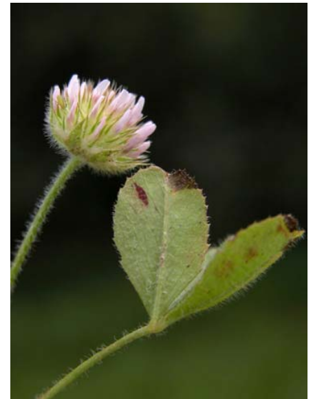
Small-head Clover Trifolium microcephalum Native Annual Pea Family