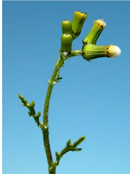
Common Groundsel Senecio vulgaris Introduced Annual Sunflower Family