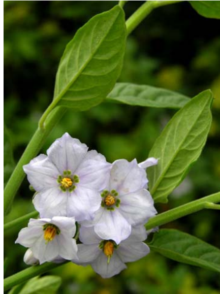
Blue Witch Solanum umbelliferum Native Perennial Nightshade Family