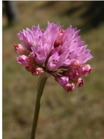
Pink / Serrated Onion Allium serra Native Perennial Lily Family