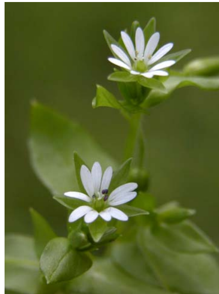
Common Chickweed Stellaria media Introduced Annual Pink Family