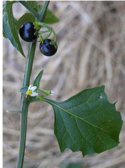
Small-flower Nightshade Solanum americanum Native Annual-Perennial Nightshade Family