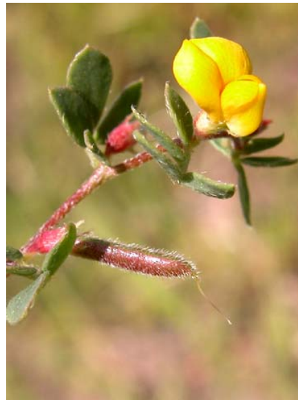
California Lotus Lotus wrangelianus Native Annual Pea Family