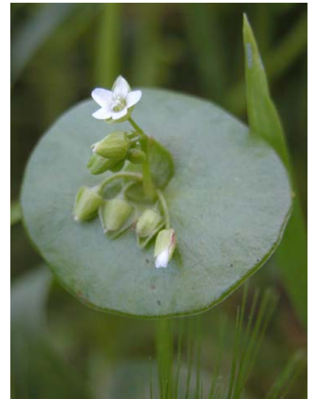
Common Miner's Lettuce Claytonia perfoliata ssp. perfoliata Native Annual Purslane Family