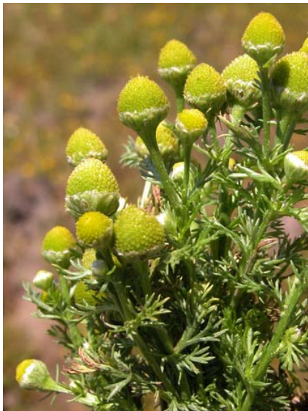
Pineapple Weed Chamomilla suaveolens Introduced Annual Sunflower Family