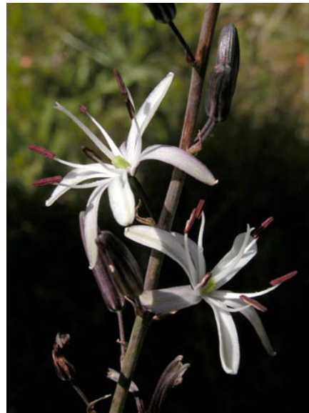
Common Soap Plant Chlorogalum pomeridianum var. pomeridianum Native Perennial Lily Family