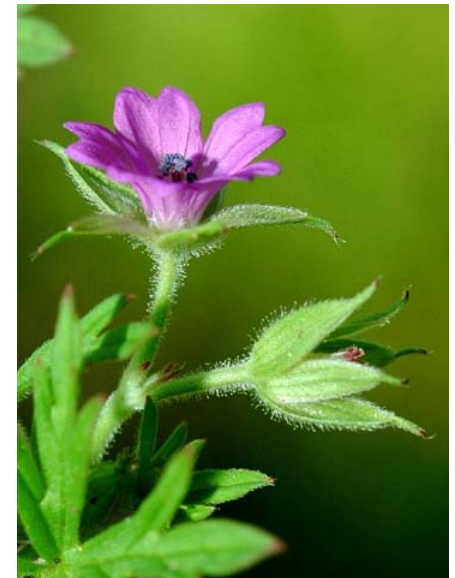
Purpletip Cut-leaf Geranium Geranium dissectum Introduced Annual Geranium Family