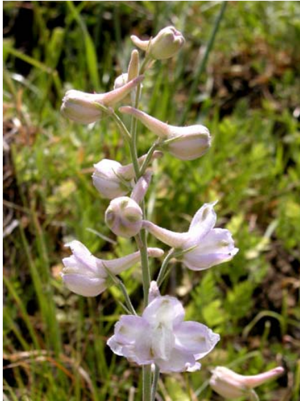
Pale Western Larkspur Delphinium hesperium ssp. pallescens Native Perennial Buttercup Family