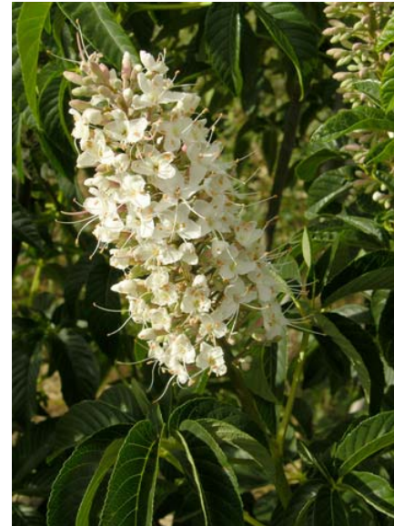
California Buckeye Aesculus californica Native Perennial Buckeye Family