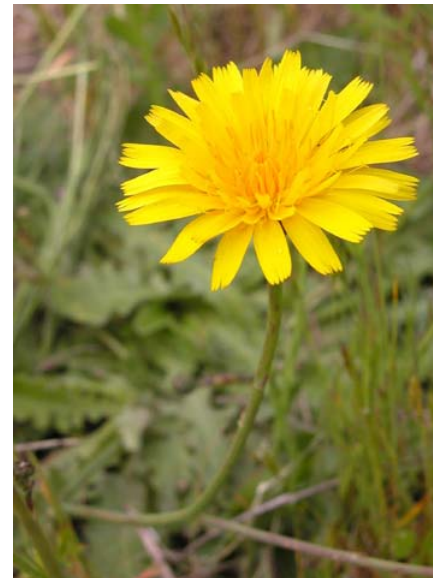
Rough Cat's-ear Hypochaeris radicata Introduced Perennial Sunflower Family