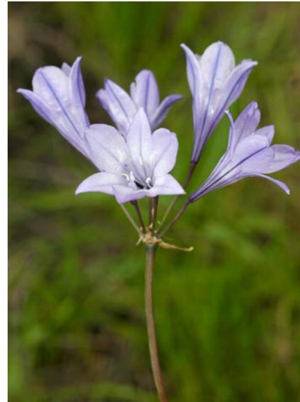
Ithuriel's Spear Triteleia laxa Native Perennial Lily Family