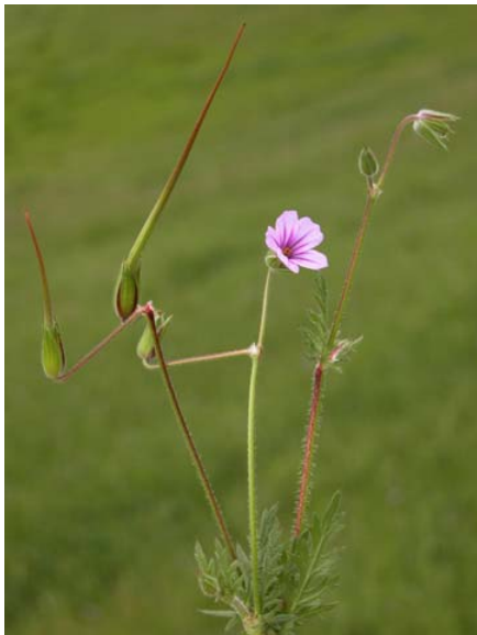
Long-beaked Filaree Erodium botrys Introduced Annual Geranium Family