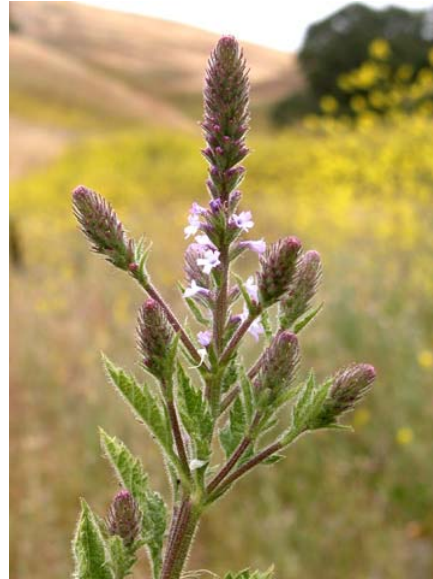
Robust Vervain Verbena lasiostachys var. scabrida Native Perennial Vervain Family