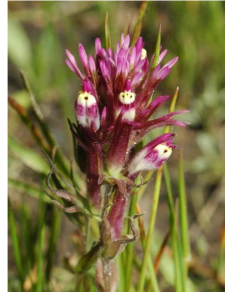
Common Owl's Clover Castilleja densiflora ssp. densiflora Native Annual Snapdragon Family