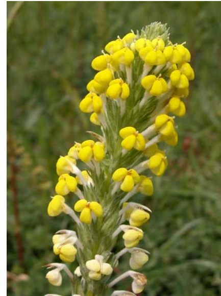
Yellow Johnny-tuck Triphysaria eriantha ssp. eriantha Native Annual Snapdragon Family