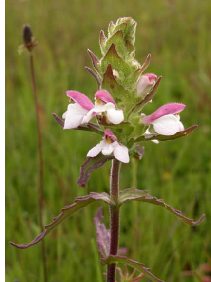
Bellardia Bellardia trixago Introduced Annual Snapdragon Family