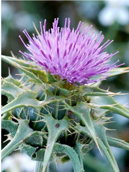
Milk Thistle Silybum marianum Introduced Annual-Biennial Sunflower Family