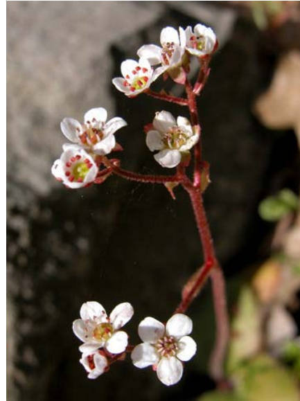
California Saxifrage Saxifraga californica Native Perennial Saxifrage Family