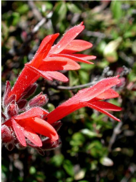
California Fuchsia Epilobium canum ssp. canum Native Perennial Evening Primrose Family