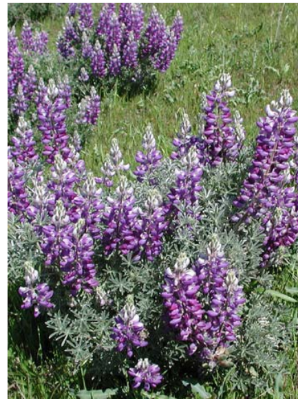
Blue Bush / Silver Lupine Lupinus albifrons var. albifrons Native Perennial Pea Family