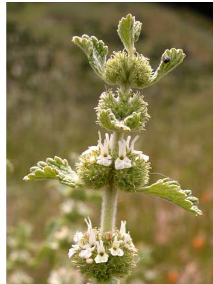
Common Horehound Marrubium vulgare Introduced Perennial Mint Family