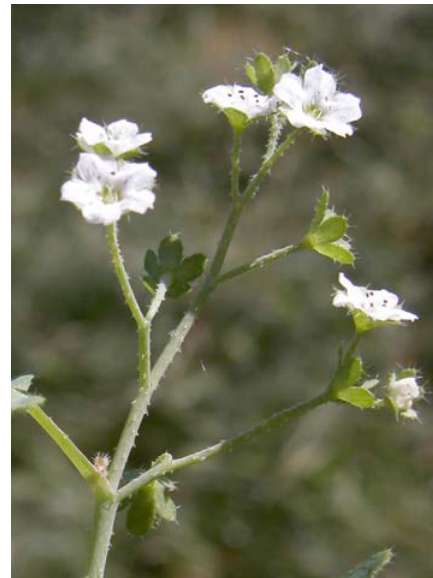
White Fiesta Flower Pholistoma membranaceum Native Annual Waterleaf Family