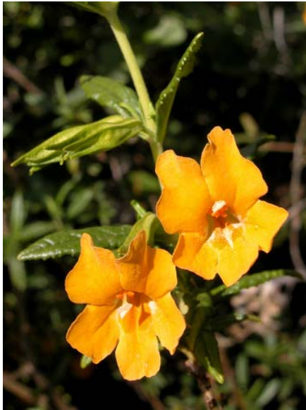
Bush Monkey Flower Mimulus aurantiacus Native Perennial Snapdragon Family