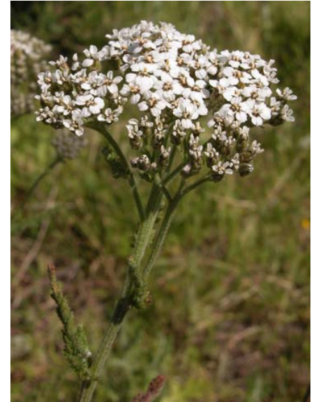
Yarrow Achillea millefolium Native Perennial Sunflower Family