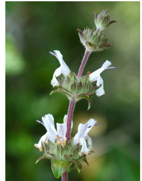
Black Sage Salvia mellifera Native Perennial Mint Family