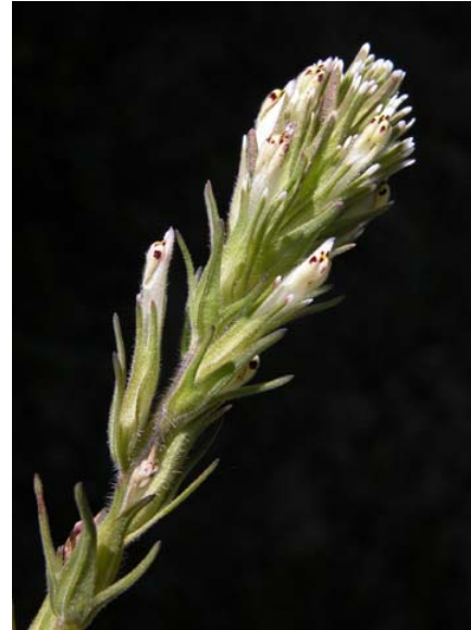
Valley Tassels Castilleja attenuata Native Annual Snapdragon Family