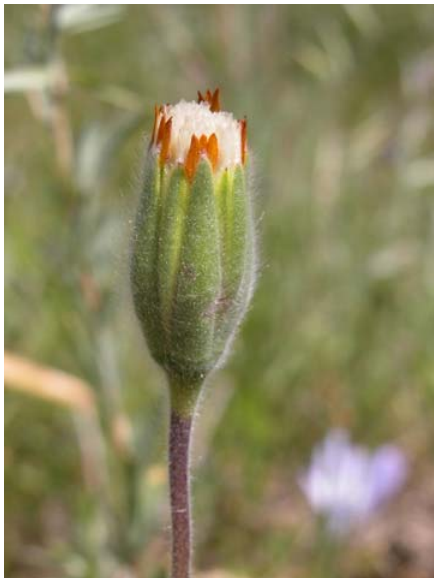
Blow Wives Achyrrachaena mollis Native Annual Sunflower Family