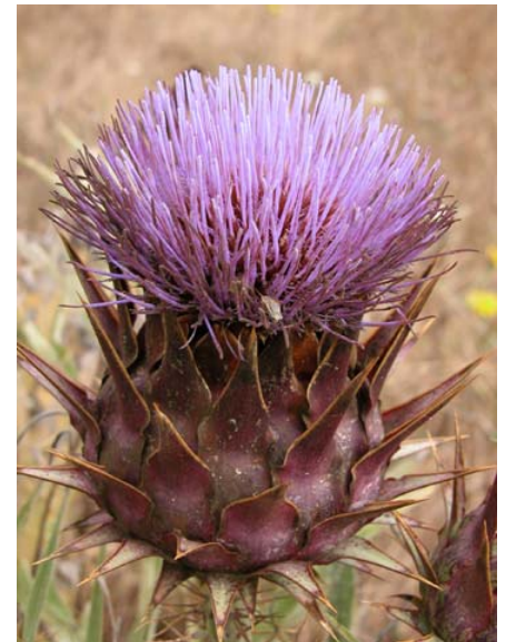
Cardoon / Artichoke Thistle Cynara cardunculus Introduced Perennial Sunflower Family