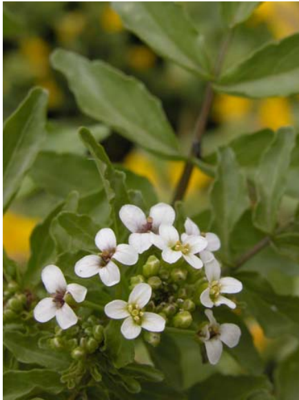
White Water Cress Rorippa nasturtium-aquaticum Native Perennial Mustard Family