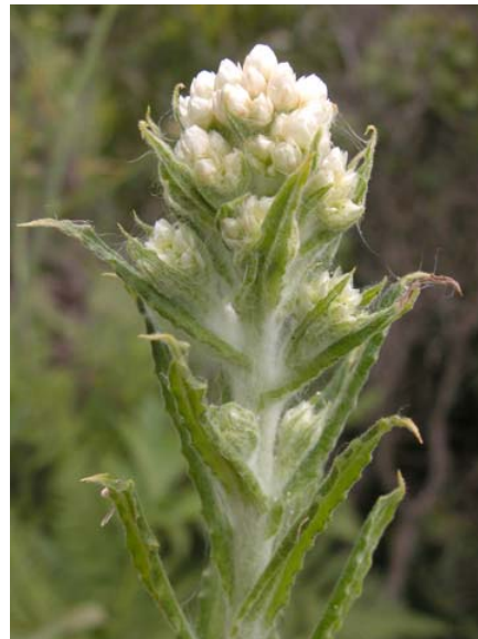
California Everlasting Gnaphalium californicum Native Biennial Sunflower Family