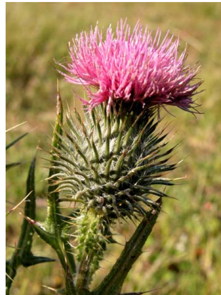
Bull Thistle Cirsium vulgare Introduced Biennial Sunflower Family