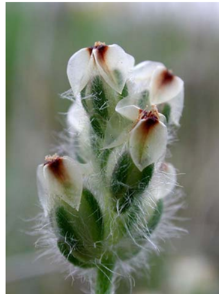
California Dwarf Plantain Plantago erecta Native Annual Plantain Family