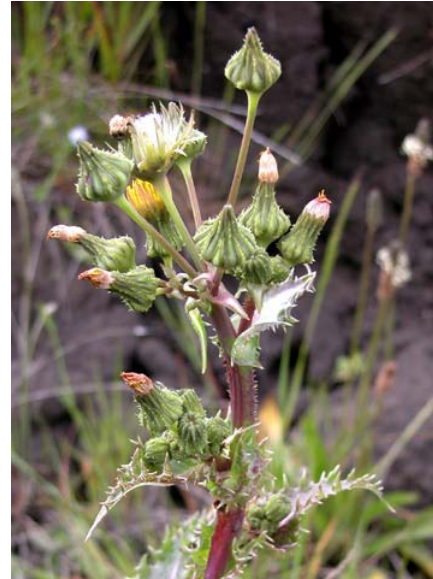
Prickly Sow Thistle Sonchus asper ssp. asper Introduced Annual Sunflower Family