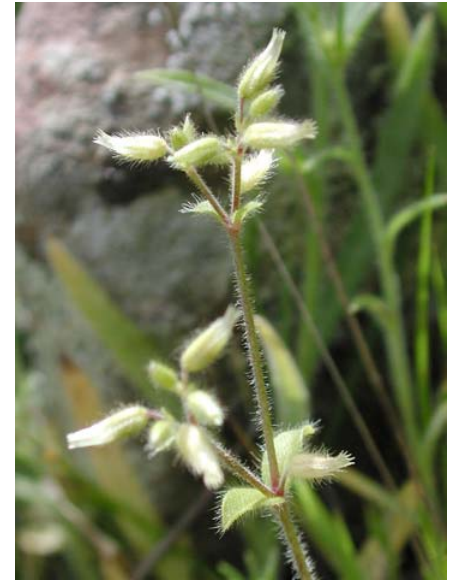
Mouse-ear Chickweed Cerastium glomeratum Introduced Annual Pink Family