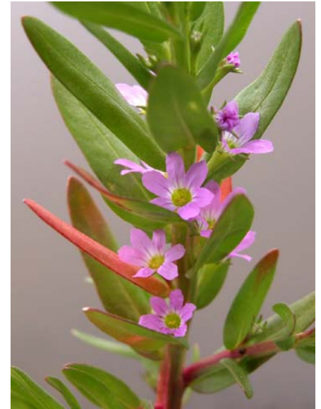
Grass Poly Loosestrife Lythrum hyssopifolium Introduced Annual-Perennial Loosestrife Family