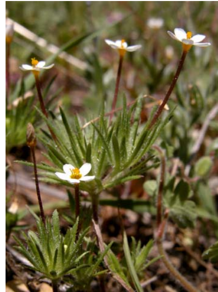
Bicolor Linanthus Linanthus bicolor Native Annual Phlox Family