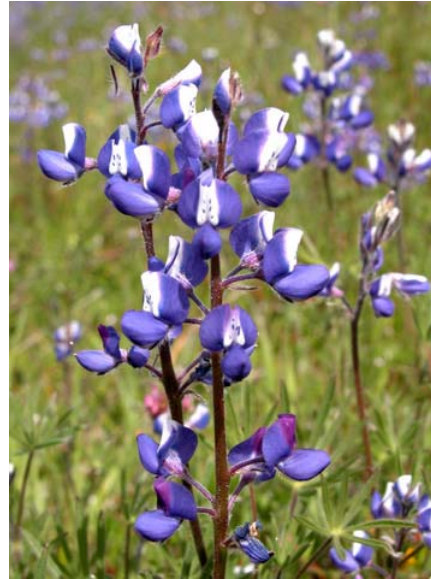
Miniature Dove Lupine Lupinus bicolor Native Annual Pea Family